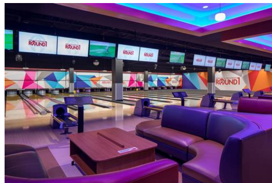
Round One Bowling & Amusement

With our last in-person meeting in January, and social event at Round One Bowling and Amusement in February,