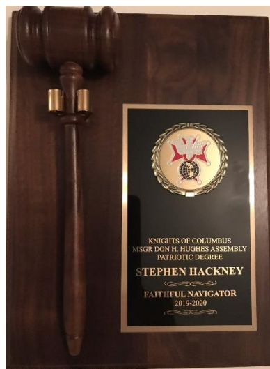
Plaque of Appreciation to PFN